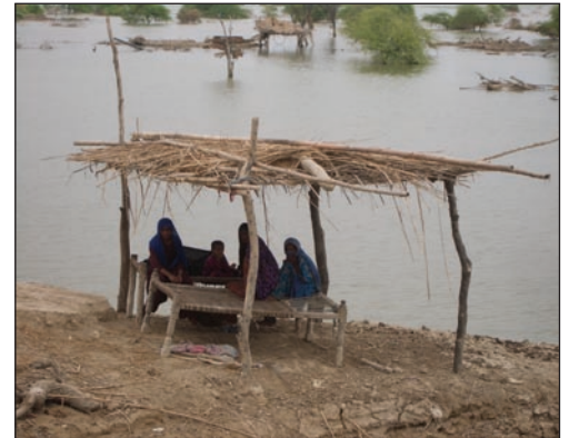
A family takes shelter after floods in Pakistan – here, poverty means more than lack of income.

The two polarisation indices used most often are by Wolfson, and by Duclos, Esteban and Ray (DER). The Wolfson bipolarisation measure is the more conventional, assuming two groups in the income distribution: those above average